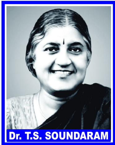
Dr. T.S. SOUNDARAM